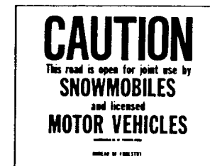
State Forest Roads

The posting of township roads is done with a green sign containing the side view silhouette of a snowmobile and rider in white.